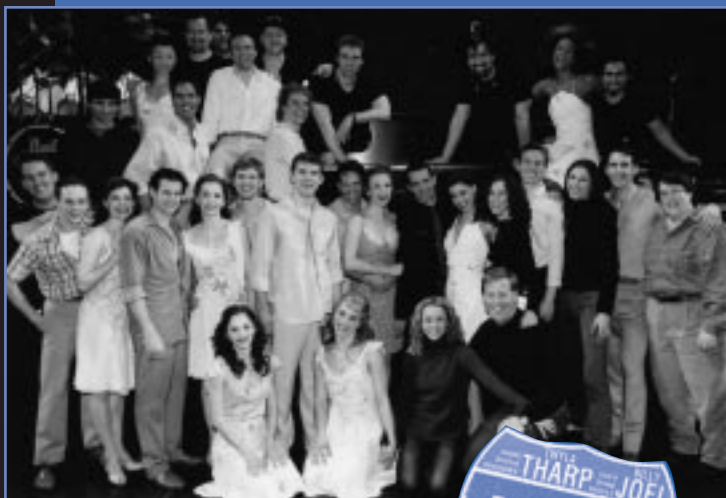
MOVIN' OUT "wowed" the crowd – they were dancing in the aisles – at a very Special Performance.