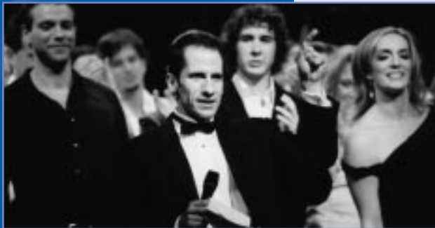
The brilliant Musical Director/Artistic Producer Seth Rudetsky (center) receives a standing ovation, along with the fantastic cast including Adam Pascal, Josh Groban and Julia Murney.