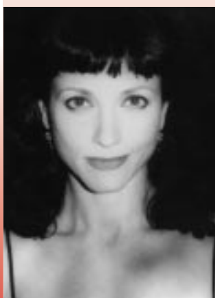
Bebe Neuwirth Chair

From exclusive luncheons and dinners with prominent people in the entertainment world, to the highest priority ticket service, each Spotlight level offers you something unique and exciting.