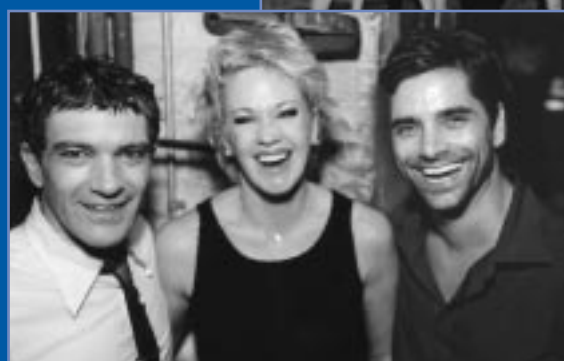
(Left to right) NINE superstar Antonio Banderas celebrates backstage with wife Melanie Griffith and John Stamos.