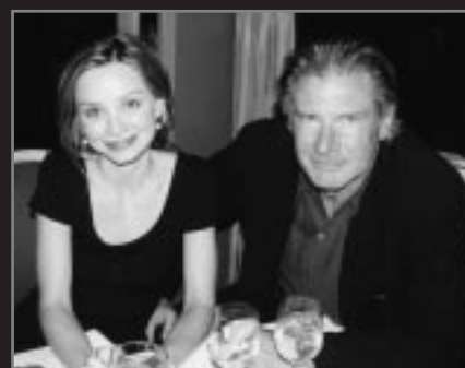
Our enchanting Eve Harrington, Calista Flockhart with Harrison Ford.

Jennifer Tilly hosted The Actors' Fund and Aid For AIDS annual Tony® Awards Party. Held this year at the Skirball Center in LA, Stephanie Powers graciously presented Rita Moreno with The Actors' Fund's Julie Harris Award at the fantastic party.