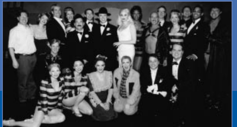
Congratulations to the absolutely fabulous cast of THE PRODUCERS for their Special Performance to benefit The Fund.