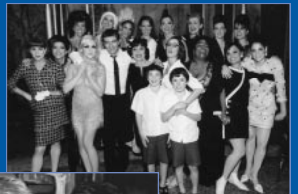
The sizzling cast of NINE enjoys a triumphant Special Performance.