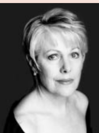
Lynn Redgrave Chair

By joining us, you will gain valuable privileges and a behind-the-scenes involvement with The Fund. Most of all, you will have the satisfaction of knowing that your generosity is making a difference in the lives of friends and colleagues in need.