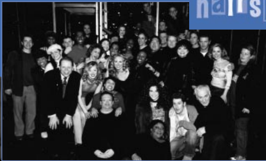
Applause, applause for the talented cast of the wildly-popular HAIRSPRAY.