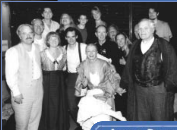
The haunting cast of LONG DAY'S JOURNEY INTO NIGHT