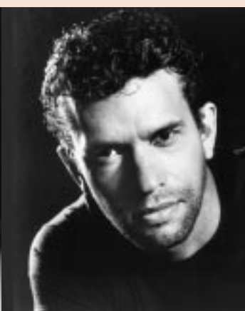
Brian Stokes Mitchell Chair