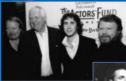
CHESSE creators Benny Andersson, Tim Rice and Björn Ulvaeus congratulate Josh Groban (second from right) on a sensational performance.