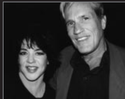
Randal Kleiser toasts Stockard Channing on her marvelous performance.